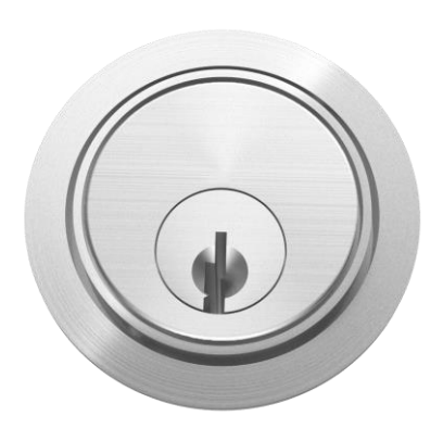
24RC *Mortise cylinder not included