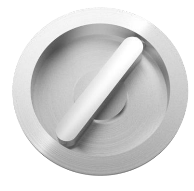
*5mm diamond spindle (can be customized)