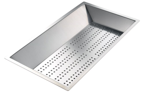
Stainless steel perforated pan 8151 000