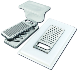
Grating kit complete with ring support and food collection tray 8159 101