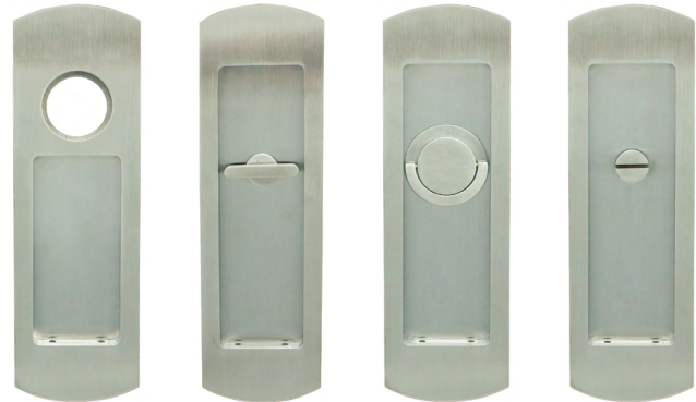
FH2903 Flush Pull w/ Cylinder Hole