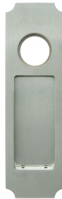
FH3203 Flush Pull w/ Cylinder Hole