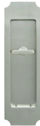
FH3282 Flush Pull w/ TT08 Thumbturn