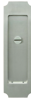
FH3204 Flush Pull w/ Thumbturn Release