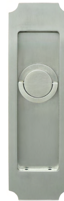
FH3292 Flush Pull w/ TT09 Thumbturn