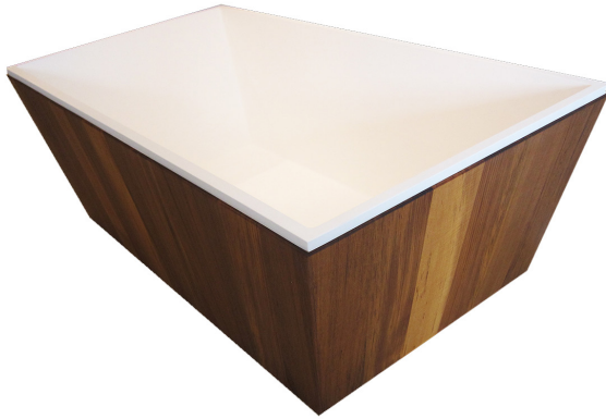
Features an integrated overflow and Teak Wrap.