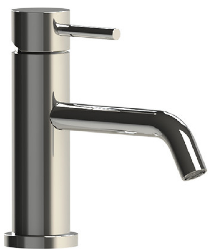
SINGLE CONTROL LAV SET (2 1/2" AERATOR TO DECK) (LESS DRAIN)